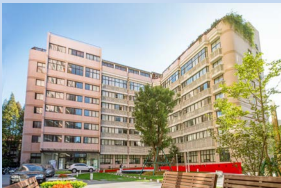
Guoshun Campus No. 670 Guoshun Road