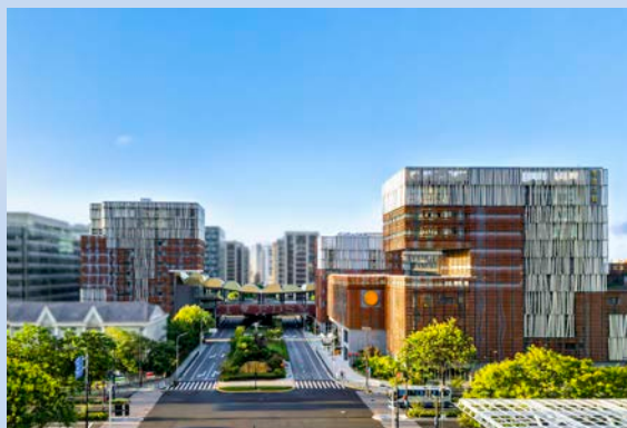
Zhengli Campus No. 558 Zhengli Road